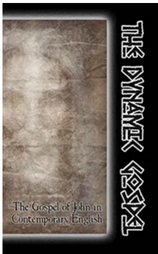
A Compassion Radio Exclusive!