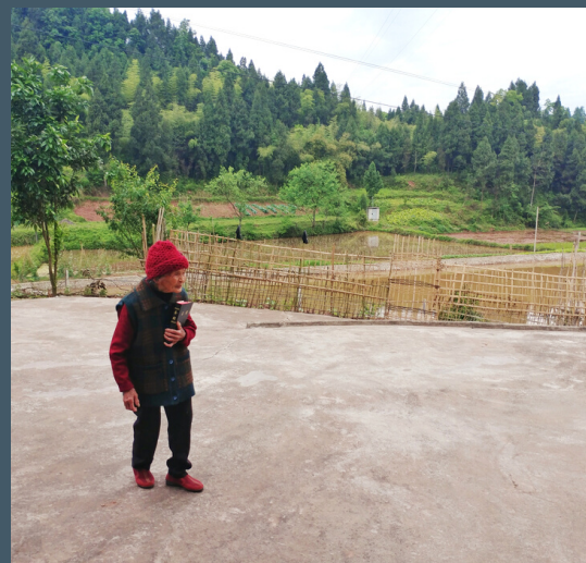
One of the dear people you provided with a Bible in 2019!

Giving the gift of the WORD to the WORLD has NEVER been more IMPORTANT!