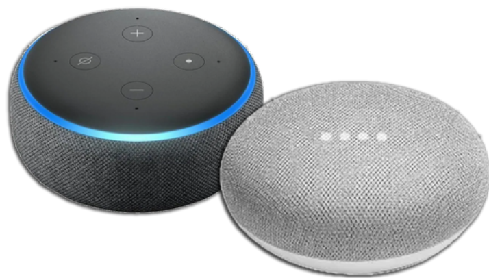
Amazon Echo Dot and Google Nest Mini - A new home for Compassion Radio!

Secondly, if you'll make your gift monthly and join our 'Vision Team', or increase your current Vision Team gift to $50/month or more, I'll send you - at your request - a new Google Nest Mini or Amazon Echo Dot. At the sound of your voice, both of these amazing desktop speakers deliver the Compassion Radio program to you any time that works for you! Just say "Google! [or Alexa!] Play Compassion Radio!" If you have home internet, this is the future, and the future of Compassion Radio outreach.